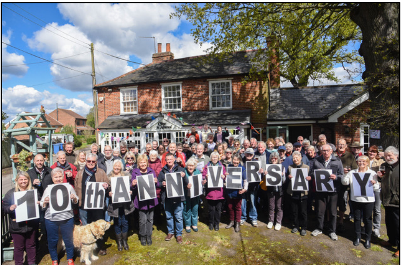
The Case is Altered Community Pub celebrating their 10th anniversary