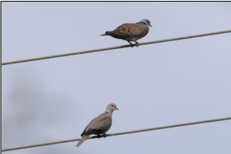
Pic 1 - A Turtle Dove above a Collared Dove.

Mark Nowers Turtle Dove Conservation Adviser, Essex