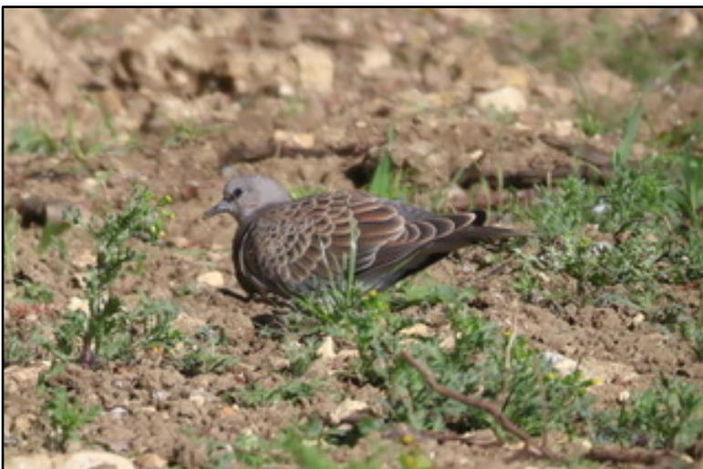
Pic 2 - A juvenile Turtle Dove feeding on supplementary seed broadcast by a Turtle Dove friendly farmer

Turtle Doves are slightly smaller and have the rich burnt-orange and black patterning on the back.