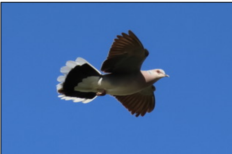
Pic 3 - Turtle Doves perform a display flight fanning their tail. The black and white band really stands out.